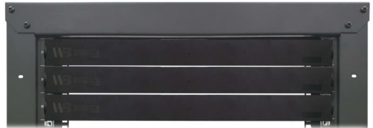
Blanking panels installed.

Easy to install and remove without the use of any tools. Simply push the snap-in clips into the racks' mounting holes.